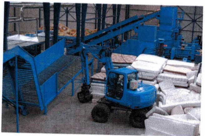
2. At the facility, mattresses are loaded on to conveyor belts.