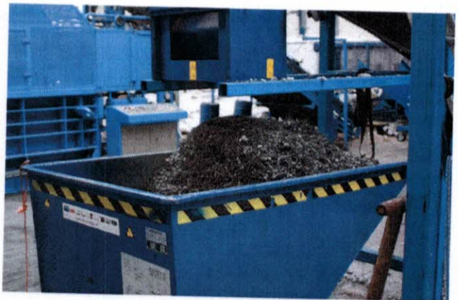
4. Steel is separated and shredded. Steel is used to manufacture new steel products by the steel industry.