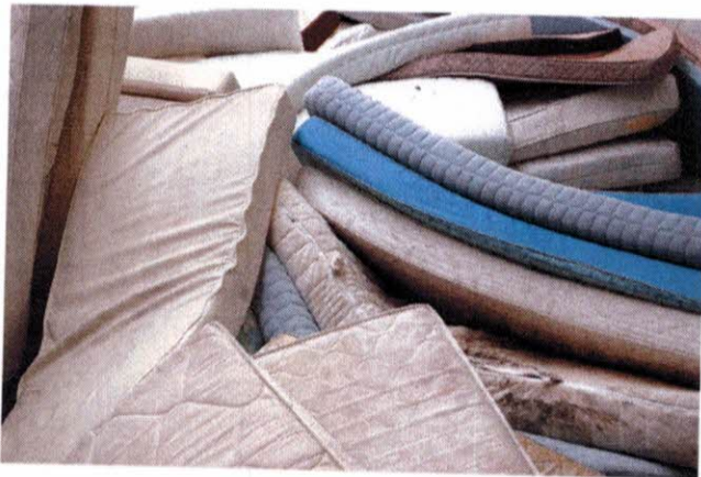
1. End-of-life mattresses are collected from Councils, Waste Transfer Stations, Retailers and Hotels.