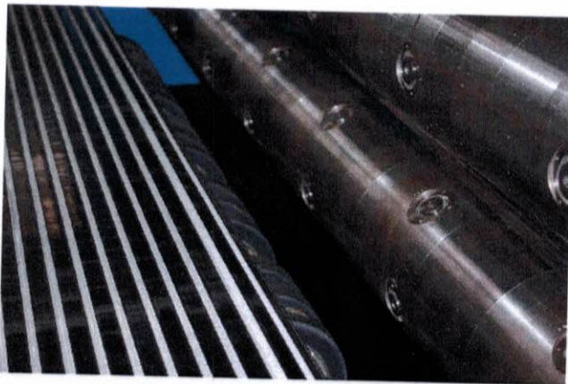
3. A peel roller removes the outer layer textile which is then baled to be used in manufacturing carpet underlay.