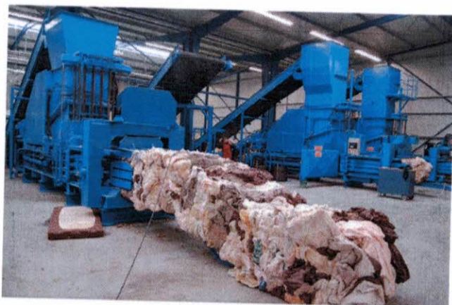
5. The final step is to cut the foam and press it into bales. Foam is used in the manufacturing of carpet underlay.